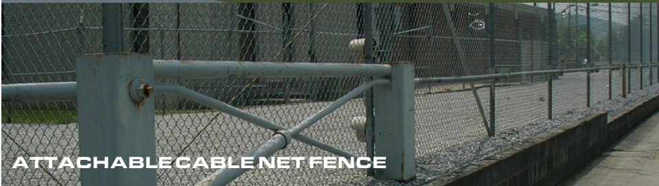
ATTACHABLE CABLE NET FENCE

The CABLE NET FENCE is an energy absorbing post and cable barrier system that prevents vehicular intrusion. This anti-ram product transforms the existing security perimeter to provide a crash-rated barrier for sites with high vulnerability, critical assets, and elevated security needs.